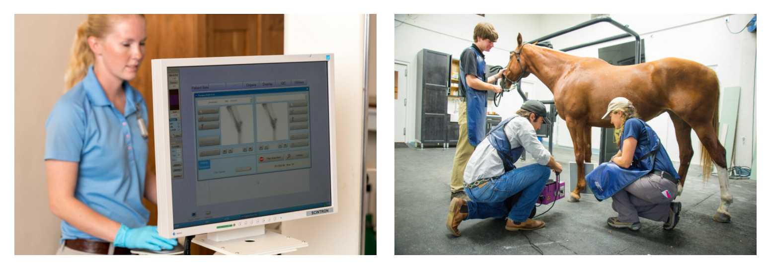
PBEC is one of the only equine hospitals in the U.S. offering nuclear scintigraphy (left). The clinic also offers radiography (right) for diagnosing conditions and for pre-purchase examinations.

Palm Beach Equine Clinic takes pride in being a world-class facility for the diagnosis, treatment, and recovery of some of the industry's most valued sport horses, as well as lifelong companions. The <u>Advanced Imaging Department</u> is a vital area of the Equine Hospital that helps veterinarians diagnose subtle or acute conditions.