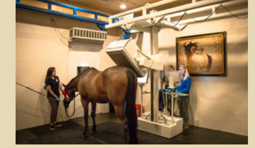
Nuclear scintigraphy, commonly referred to as a bone scan, allows veterinarians to detect areas of concern before they may be visible with other imaging modalities. Nuclear scintigraphy utilizes a gamma camera that detects a radioactive isotope given intravenously. The isotope travels to bone and abnormal uptake is detected by areas that showcase increased radiopharmaceutical uptake, which "light up" and can indicate potential sites of injury.